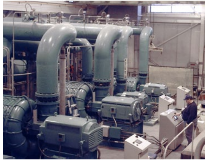
The City of Beloit WPCF aeration blower system