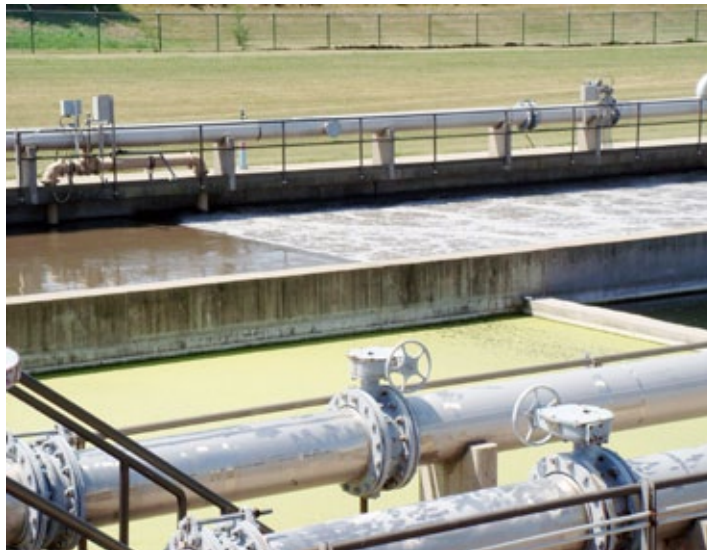
The City of Beloit Water Pollution Control Facility

In addition, an ABB DriveMonitor™ was selected for monitoring, controlling and remote diagnostics via a wall-mounted PC connected to the telephone line.