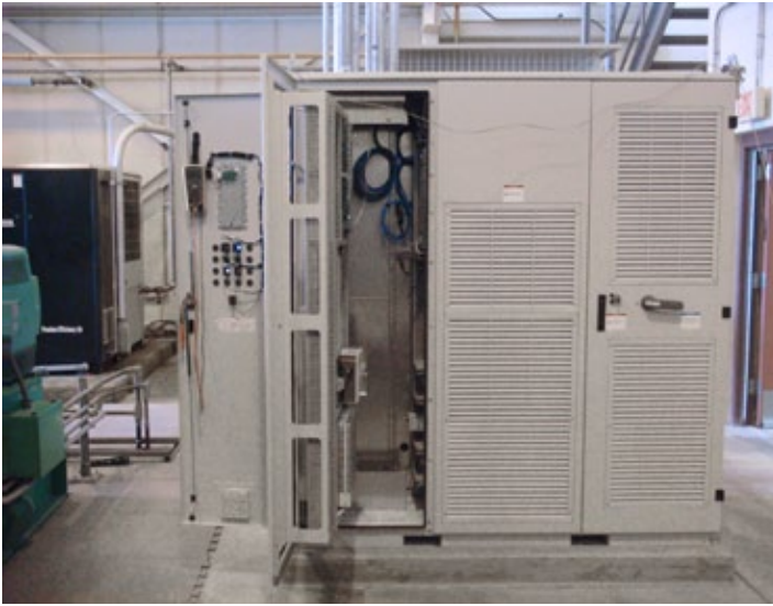
ABBs ACS 2000 drive in the blower room.